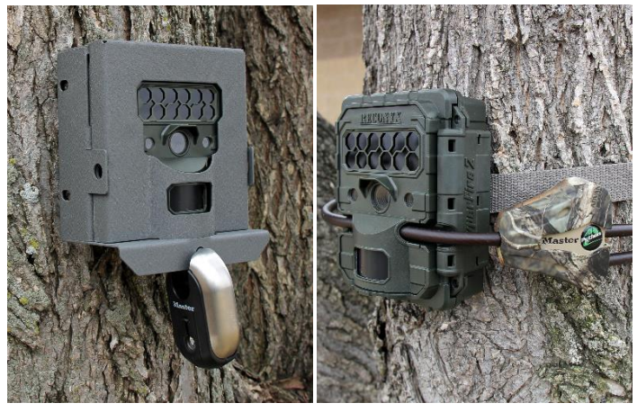
HyperFire 2<sup>™</sup> Security Enclosure