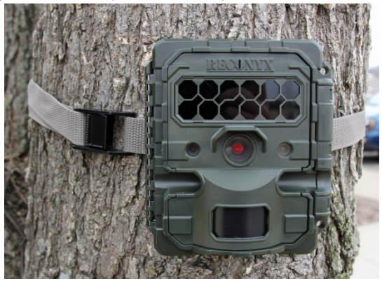
Mounting Camera with Adjustable Webbing Strap (included)

We recommend that you mount your camera at the approximate height of your target subject, and then aim the camera straight out for the best chance of sensing motion in the active detection zone.